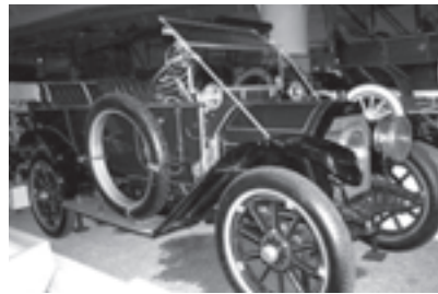
1912 Cadillac

The Cadillac is a great-looking car (see photo). The paint job was vibrant, the leather seats had a distinctive luxurious smell, the chrome was polished, and the whole thing looked perfectly elegant. The engine ran smoothly, and the car drove regally down the street attracting attention from every direction. The owner has clearly invested a terrific amount of effort, knowledge, and money to make it look and run so beautifully, and I admire the passion behind the preservation of such an elegant artifact.