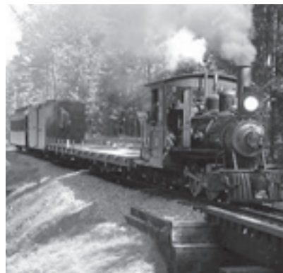
WW&F