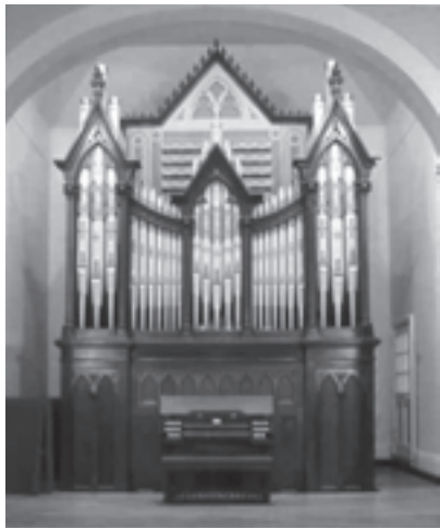
Hook #466, 1868

home of J. P. Morgan with 250 electric lights on Thursday, June 8, 1882. 2 Ernest Skinner was committed to the use of direct-current electricity to operate the actions of his organs by about 1904.