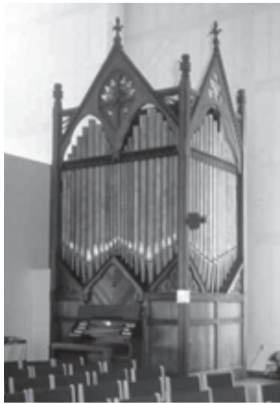
Hook #529, 1870

It's amazing that you can play music written a year or two ago on an organ built just after the Civil War. How did