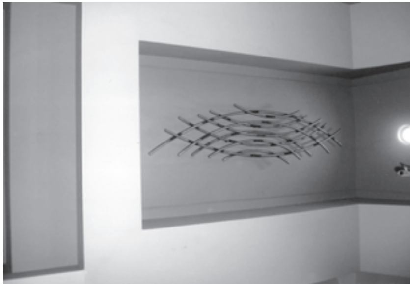
Wall sculpture in Krapf Organ Studio